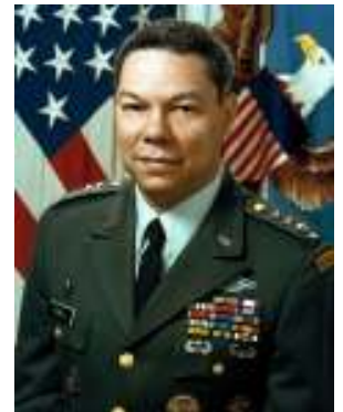
GEN Colin Powell Chairman of the Joint Chiefs

For the first time in my life I was a member of a brotherhood," GEN (R) Colin Powell would later say about the Pershing Rifles. "The discipline, the structure, the camaraderie, the sense of belonging were what I craved. I found a selflessness within our ranks that reminded me of the caring atmosphere within my family. Race, color, background, income meant nothing".